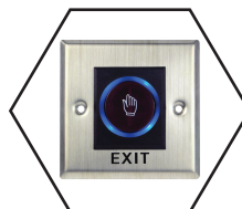
INFRARED EXIT SWITCH