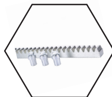
GALVANIZED STEEL GEAR RACK